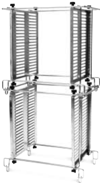
Two CBC11C's Stacked