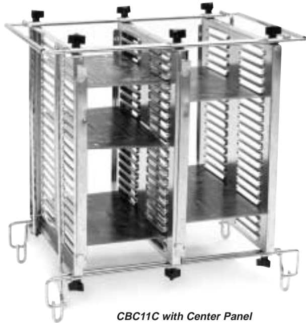
CBC11C with Center Panel